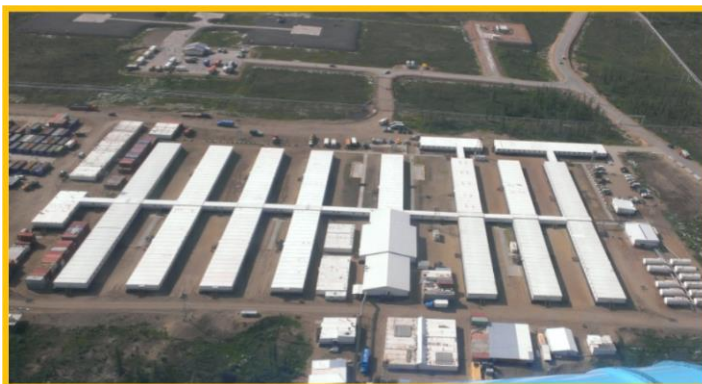
Closely located operating and production areas